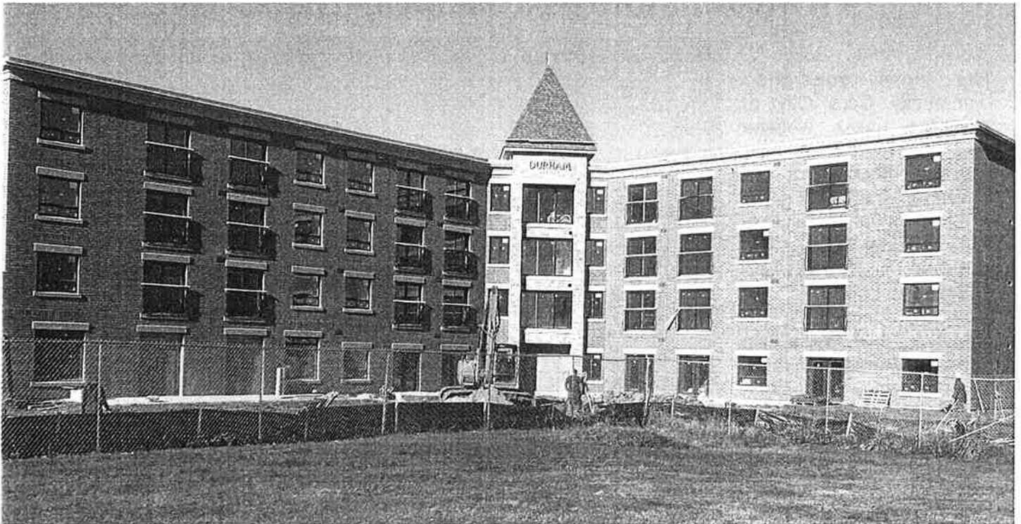
Opening soon: Officials with the Community Care Village Housing development on Victoria Avenue South in Lindsay will soon hold some open houses to allow the public to tour model suites.